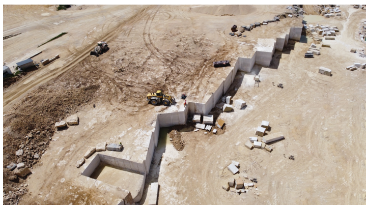
Hauteville Quarry – Mineral Expertise Group

Mineral Expertise is a group specialized in the extraction and processing of natural materials (marble, onyx, granite, etc.). The group operates its own quarries and two European processing sites: a Factory 4.0 in France (near Lyon) and another in Pietrasanta, Italy.